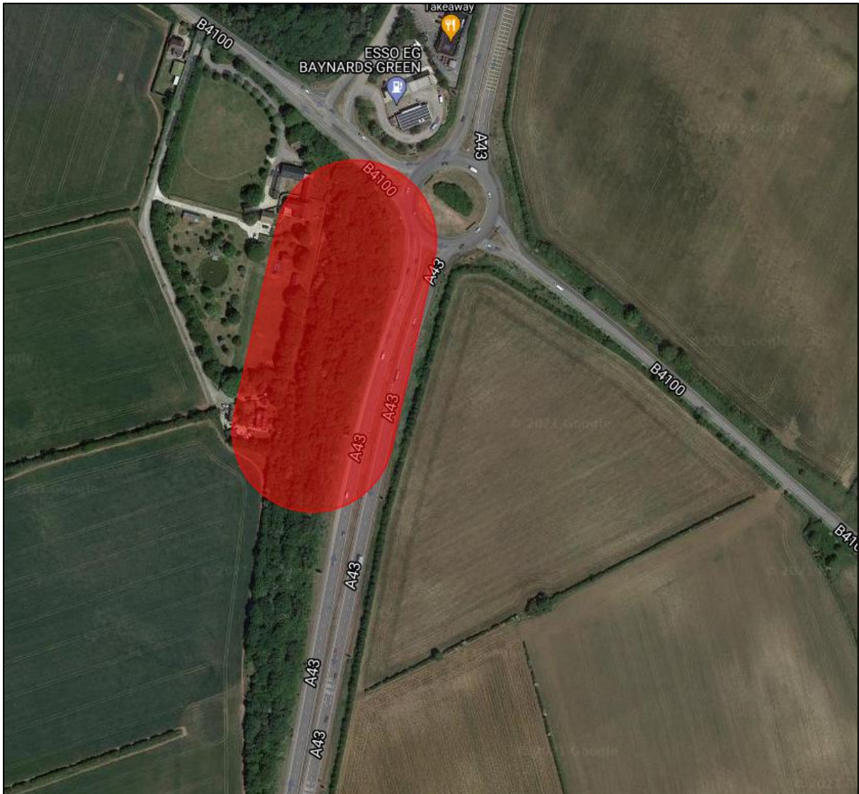
Figure 2 Road Traffic Noise adjacent to A43 (IA_ID_6125)